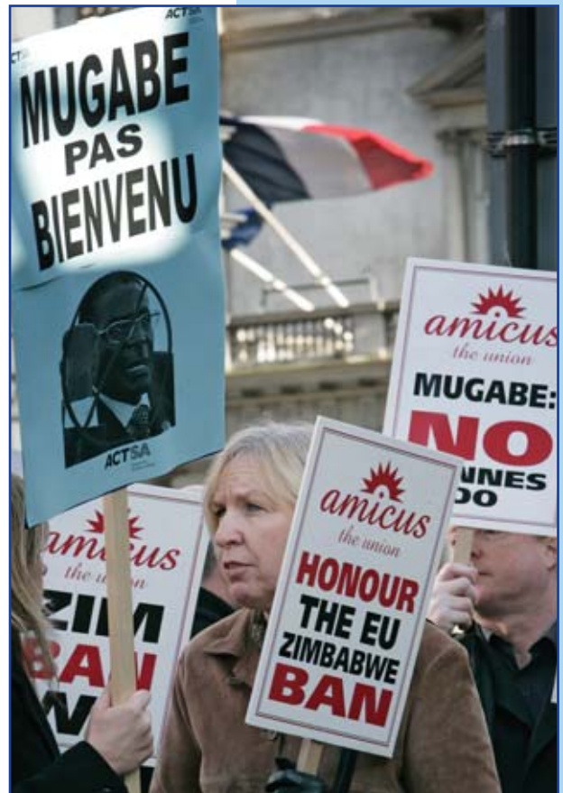
Amicus protests "No Cannes do" at the French embassy in London over any invitation to Zimbabwe President Robert Mugabe to a francophone summit

A recent ruling by the Korean High Court clears the way for migrant workers - regardless of their status - to join and form trade unions. This means undocumented workers with jobs can now be organised - a move welcomed by the Migrant Forum in Asia. The government is expected to take the case to the Supreme Court. (uni-asiapacific@uniglobalunion.org)