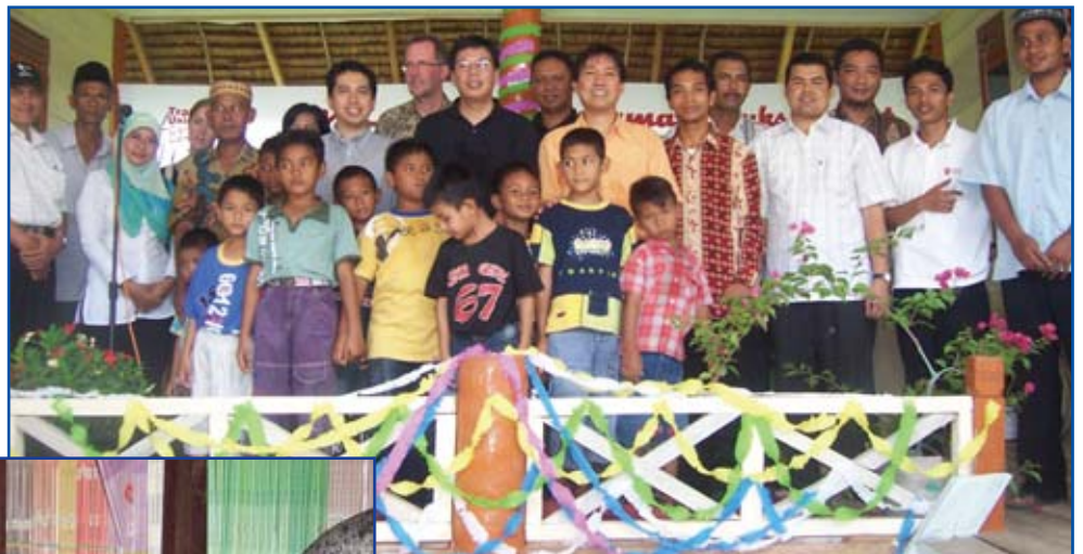
Inauguration ceremony at Cot Suruy centre