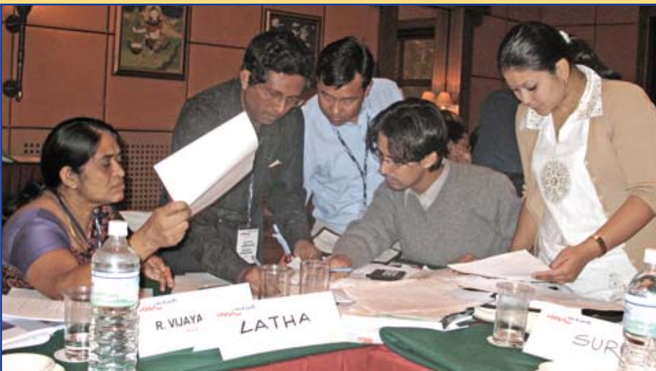
Busy empowerment workshop in Nepal