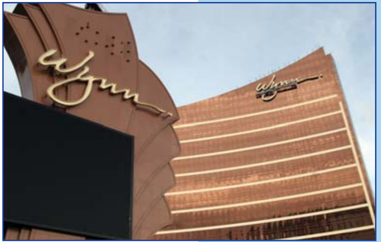
US casino operator Wynn is already established in Macau