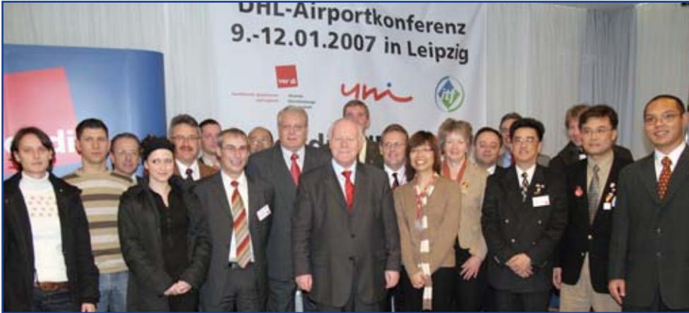
Saxony Governor Dr Georg Milbradt meets DHL unions from Germany, USA and Hong Kong