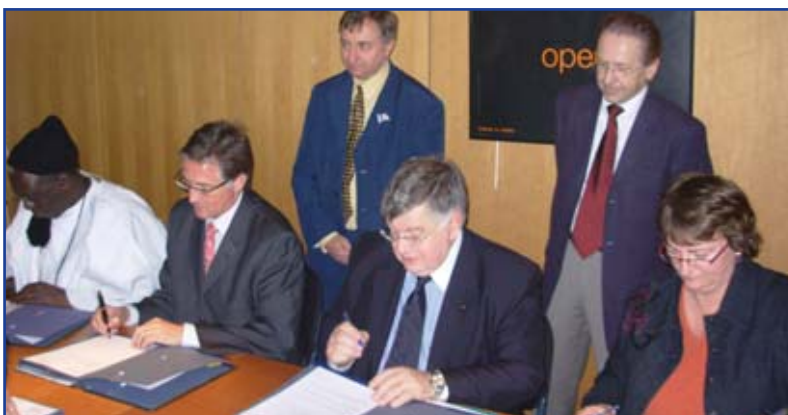
UNI signed two global agreements just before Christmas - in the NAG banking group and in France Telecom (right)