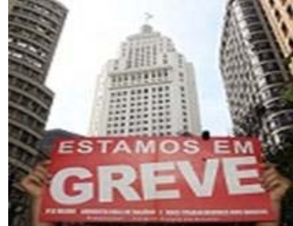
Brazil bank sector strike: time to share profits