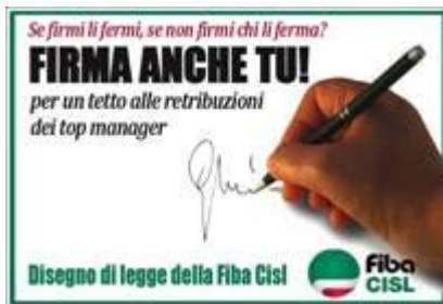
Italian campaign for a cap on top managers pay

are reported to be linked to customer service, and the working situation is often described as manageable. Training funds have been set up in Denmark and Norway.